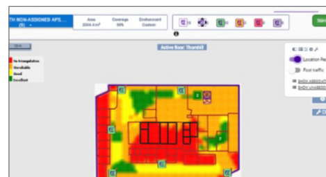
Extreme Campus Controller Wi-Fi Locationing Assessment