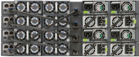
Rear View (highlighting Stackable Chassis cabling)