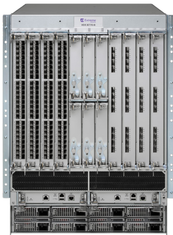
Figure 2: The VDX 8770-8 Switch supports up to 384 10 GbE ports, 216 40 GbE ports, and 48 100 GbE ports.