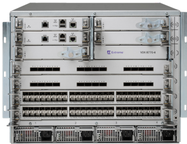
Figure 1: The VDX 8770-4 Switch supports up to 192 10 GbE ports, 108 40 GbE ports, and 24 100 GbE ports.