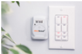
AeroScout T5H Humidity Tag Monitor humidity levels for higher patient safety

Stanley Healthcare and Extreme Networks tested and validated for critical healthcare use cases to deliver a solution that makes installation simple and allows healthcare organizations to focus on resources that enhance patient care. Extreme Networks is dedicated to providing the industry's first cloud-driven, end-to-end enterprise network. Our 100% in-sourced support and services are always available with decades of experience working with leading healthcare organizations.