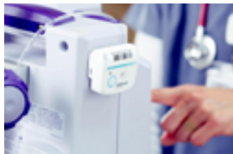
AeroScout T12 Tag Bi-directional Wi-Fi tag for asset management