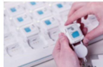
AeroScout T14 Staff Badge Rechargeable staff badge for multiple applications