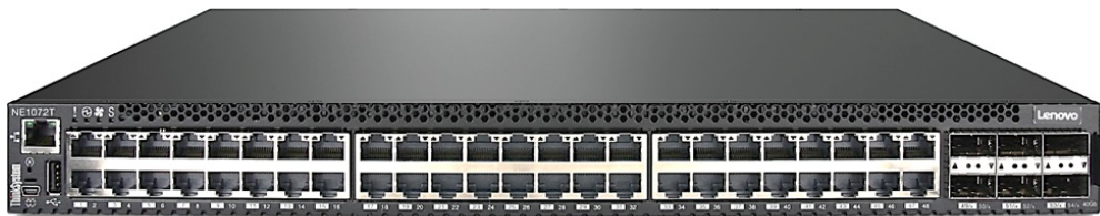
Figure 1. Lenovo ThinkSystem NE1072T RackSwitch

The Lenovo ThinkSystem NE1072T RackSwitch is shown in the following figure.